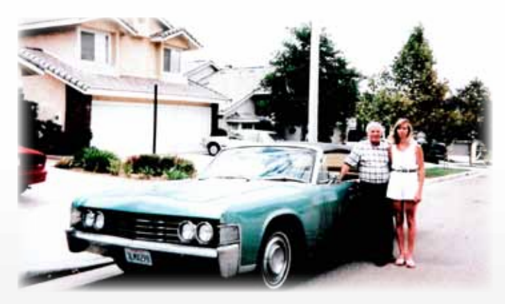
1965 Lincoln Continental Cabriolet convertible

I am currently restoring a I965 Lincoln 4-door convertible. When I restore a car I like to do as much of the work myself as possible. I contract some of the work to shops that I have grown to trust in their specific line of work. I trust LE lubricants to lubricate the drive train of my vehicles. When my restorations are done I know LE lubricants will keep my restoration in top condition.