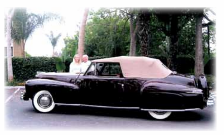
1948 Lincoln Continental Cabriolet convertible

Shown is a picture of my 1948 Lincoln Continental Cabriolet Convertible which is considered a classic car by the Classic Car Club of America. Recently, I restored the drive train including the differential, overdrive, and transmission. Everything was removed and bead blasted and powder coated. 40's era cars were notorious for leaking oil. I changed the gear oil to Monolec Gear Lubricant (703) and immediately found no leaks and the drive train ran cooler. Everyone knows these older machines don't see many miles. In fact, if I put 300 miles a year on my cars that is a lot. The nice thing about LE's gear oils is the attraction they have for the metal gears. When cars sit for a long period of time, commercial lubricants run off of the critical components like gears, rings, bearing races and seals. After sitting, the gears in the drive train are subject to wear during the initial start up. I have a lot invested in these automobiles and it's reassuring to know everything is well lubricated upon start up and the first revolution of the components. Lubrication Engineers Lubricants, lubricate, seal, cool, and will not mix with water yet still perform when water is present.